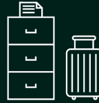
LUGGAGE & ARCHIVE STORAGE