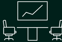
5 MEETING ROOMS