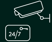
24/7 ACCESS & HIGH-TECH SECURITY